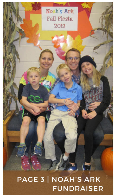
PAGE 3 | NOAH'S ARK FUNDRAISER