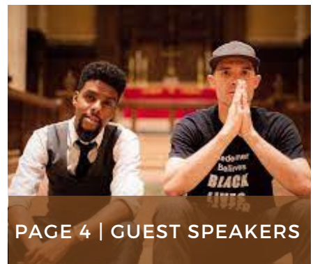
PAGE 4 | GUEST SPEAKERS