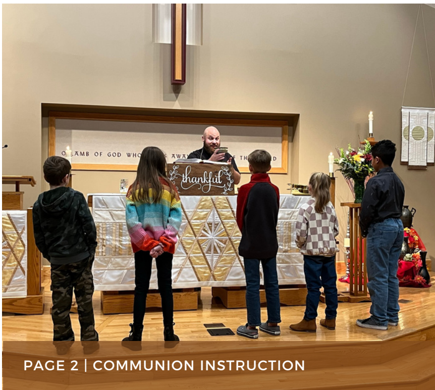
PAGE 2 | COMMUNION INSTRUCTION