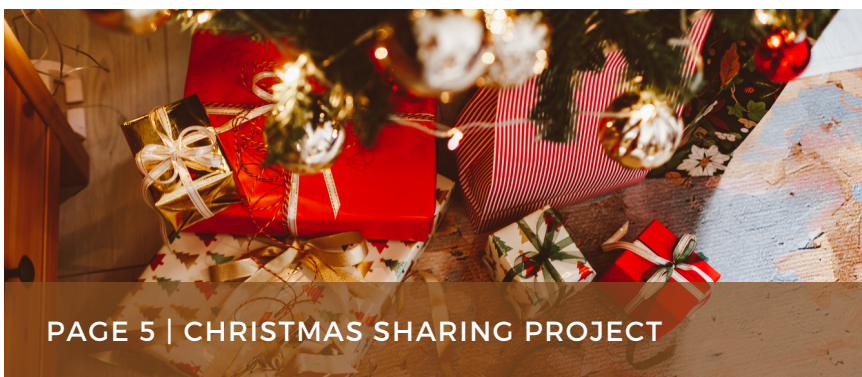
PAGE 5 | CHRISTMAS SHARING PROJECT