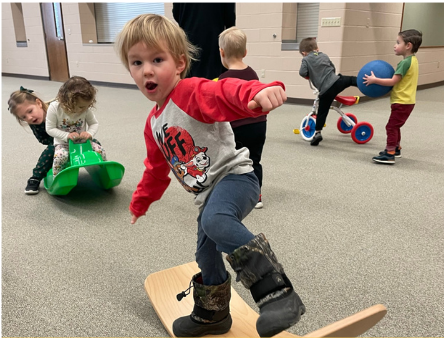
PAGE 4 | OPEN GYM