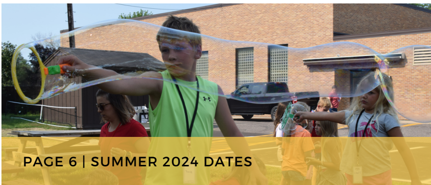
PAGE 6 | SUMMER 2024 DATES