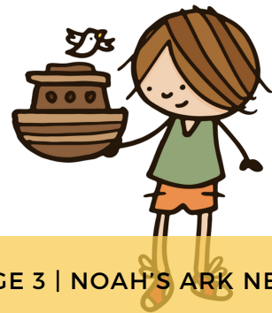
PAGE 3 | NOAH'S ARK NEWS